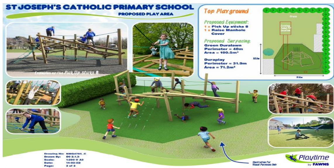
Artist's impression of our new the 'Pick Up Sticks' equipment

Our next ongoing project is to add a new, large piece of play equipment called 'Pick Up Sticks' which is estimated to cost £18,500.